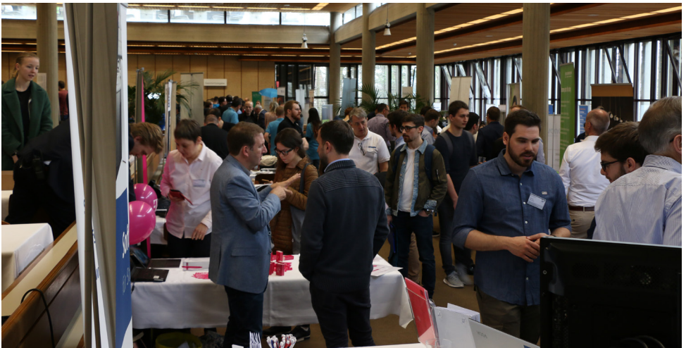
An impression of the Kontaktparty 2019

students of computer science, data science, computational biology and bioinformatics, VIS is the first point of contact for events, excursions, study support and representation on dealings with the Department of Computer Science at ETH Zurich. All these offers, from the welcome weekend for first-semester students to the exam preparation courses for the most important exams until the largest academic IT-recruiting fair in Switzerland, are organised by around 120 students on a completely voluntary basis alongside their studies. The VIS is part of the Association of Students at ETH Zurich ( VSETH ), the umbrella organisation of all student organisations at ETH Zurich, which politically represents the more than 20'000 students in the university. Like the VIS, the VSETH is omnipresent in student life outside the lecture halls.