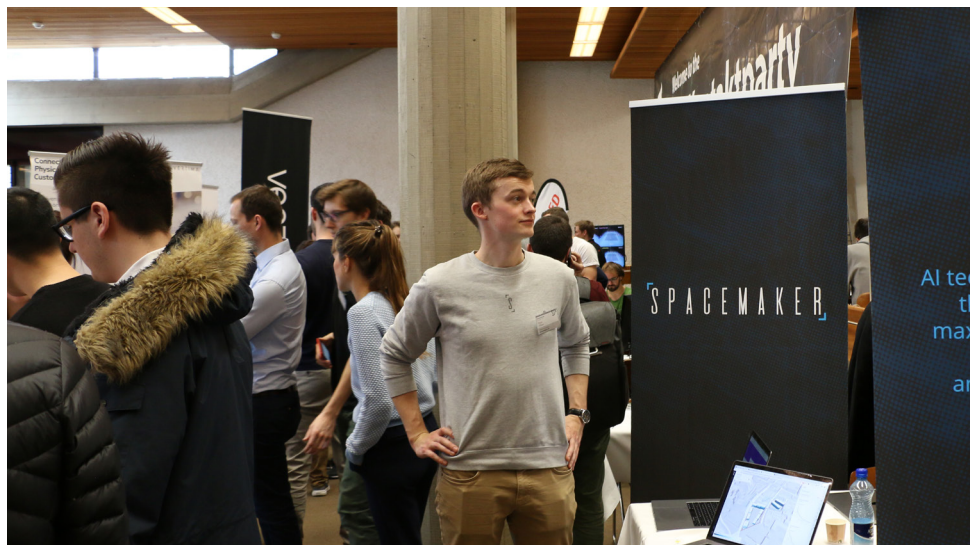
An impression of the startup section at the Kontaktparty 2019