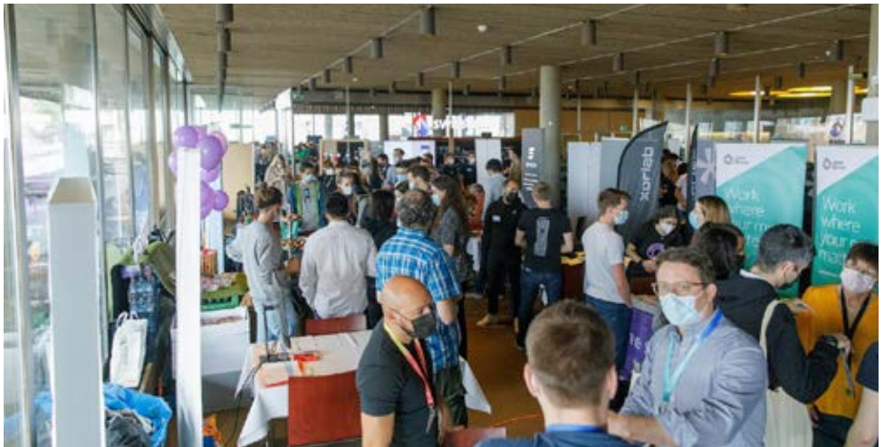
An impression of the Kontaktparty 2022

For the more than 1,600 bachelor and master students of computer science, data science, computational biology and bioinformatics, VIS is the first point of contact for events, excursions, study support and representation on dealings with the Department of Computer Science at ETH Zurich. All these offers, from the welcome weekend for first-semester students to the exam preparation courses for the most important exams until the largest academic IT-recruiting fair in Switzerland, are organised by around 120 students on a completely voluntary basis alongside their studies. The VIS is part of the Association of Students at ETH Zurich ( VSETH ), the umbrella organisation of all student organisations at ETH Zurich, which politically represents the more than 20'000 students in the university. Like the VIS, the VSETH is omnipresent in student life outside the lecture halls.