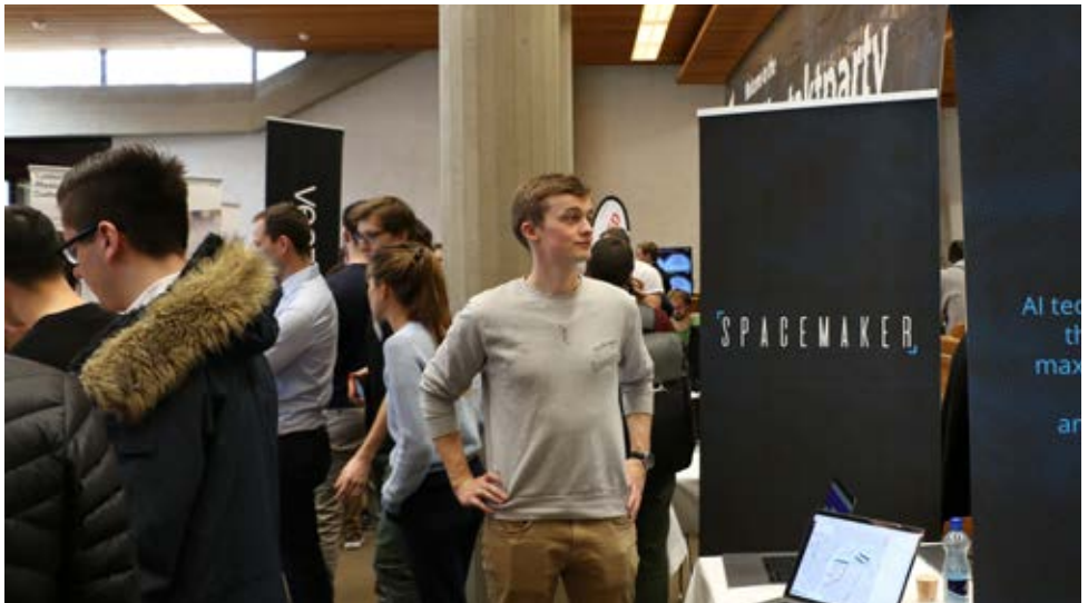
An impression of the startup section at the Kontaktparty 2019