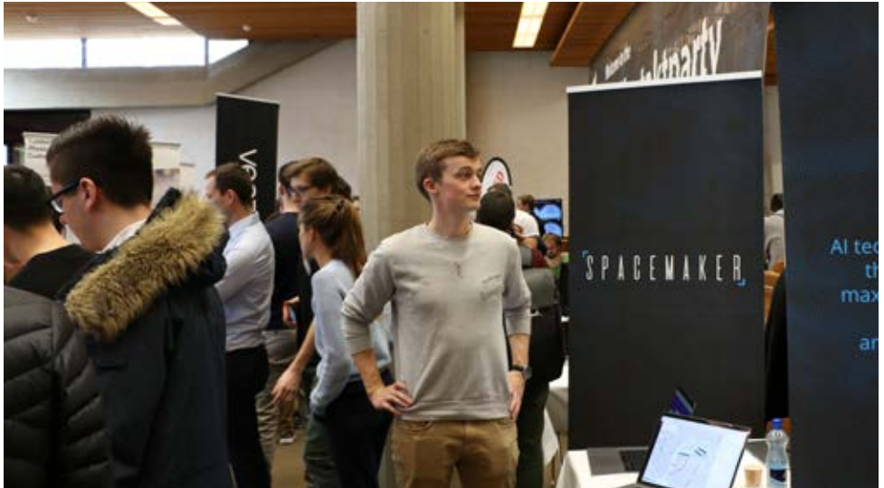
An impression of the startup section at the Kontaktparty 2019