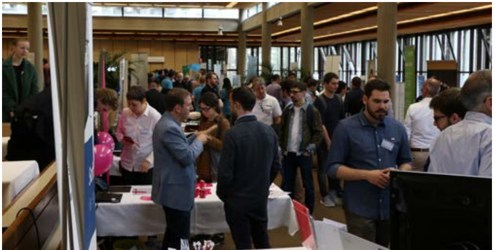
An impression of the Kontaktparty 2019

For the more than 1,600 bachelor and master students of computer science, data science, computational biology and bioinformatics, VIS is the first point of contact for events, excursions, study support and representation on dealings with the Department of Computer Science at ETH Zurich. All these offers, from the welcome weekend for first-semester students to the exam preparation courses for the most important exams until the largest academic IT-recruiting fair in Switzerland, are organised by around 120 students on a completely voluntary basis alongside their studies. The VIS is part of the Association of Students at ETH Zurich ( VSETH ), the umbrella organisation of all student organisations at ETH Zurich, which politically represents the more than 20'000 students in the university. Like the VIS, the VSETH is omnipresent in student life outside the lecture halls.